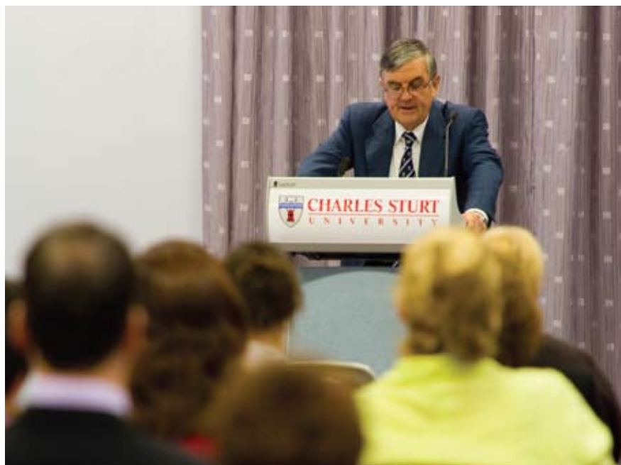
Federal Magistrates Court hosts meeting with legal practitioners, Wagga Wagga May 2008

During the year the High Court of Australia, Federal Court, Family Court and the Federal Magistrates Court established a joint costs advisory committee. The committee will inquire into, and to make recommendations on, any variations in the quantum of costs allowable to legal practitioners which should be contained in the scales of costs used by these Courts to determine the amount payable where one party must pay the legal costs of another party to a proceeding.