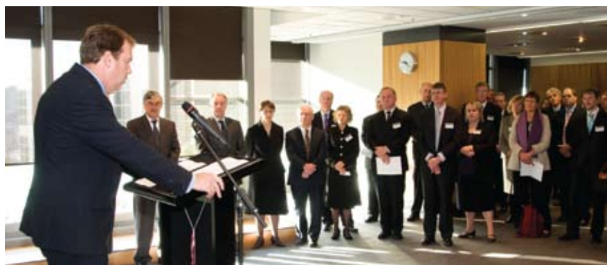
Federal Attorney-General, Robert McClelland launching the Commonwealth Law Courts Portal, Melbourne June 2008

During the year, the Court recruited a team of four regional dispute resolution co-ordinators to manage and co-ordinate the judiciary's dispute resolution services in each of the four main registries: Adelaide, Brisbane, Melbourne and Sydney. The Court's dispute resolution co-ordinators provide support to and clinical supervision of the Court's family consultants, including those appointed under regulation 7 of the Family Law Act 1975 . These new arrangements have greatly strengthened the Court's dispute resolution processes.